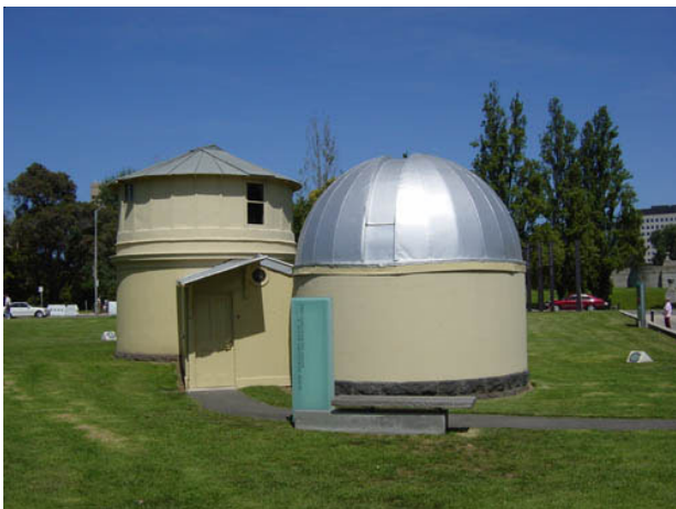
Venus Transit Observatory Queen Victoria Park Melbourne, Australia

Well, since my last issue, I've seen the Southern Cross for the first time. Since February 11, I have been on a trip to Australia (work) and New Zealand (visiting friends). The truth is that I've never been in the southern hemisphere before, and certainly never been in the southern hemisphere to observe. I didn't bring a telescope or other equipment with me,